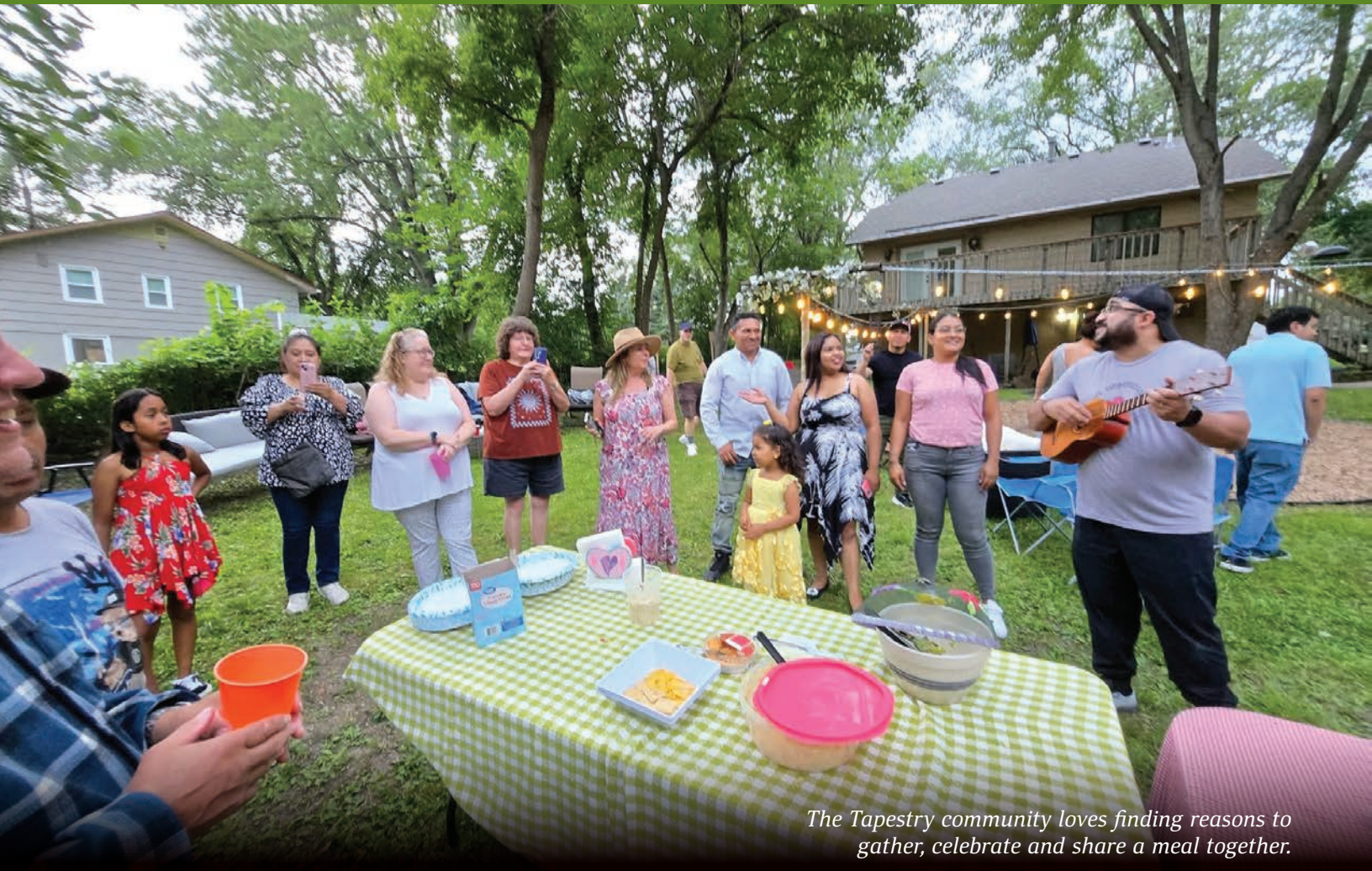
The Tapestry community loves finding reasons to gather, celebrate and share a meal together.