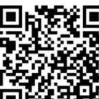
ELCA Advocacy Network Signup

And sign up for the ELCA Advocacy Network from ELCA.org/advocacy/signup for updates & Action Alert opportunities!