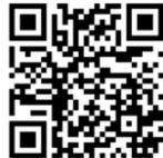
ELCA Advocacy Instagram